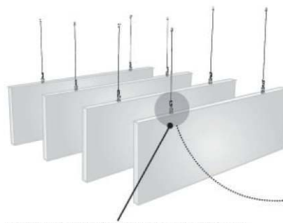
Installation Detail with Suspension Wire Kit

Clean white gloves must be used when handling the baffles. Install the first baffle and check that the installation is satisfactory before proceeding with the rest of the installation.